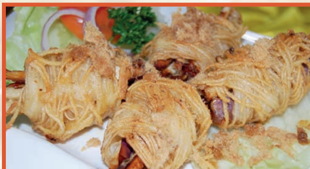
^ PAKORAS (VEGETABLES FRITTERS) ^ MEMBER: RM7.20++ VISITOR: RM9.00++ ^