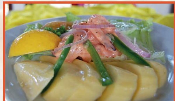
^ MANGO PRAWN SALAD ^ MEMBER: RM9.60++ VISITOR: RM12.00++ ^