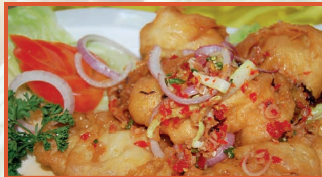
^ GRILLED FISH AUGUSTINE ^ MEMBER: RM17.60++ VISITOR: RM22.00++ ^