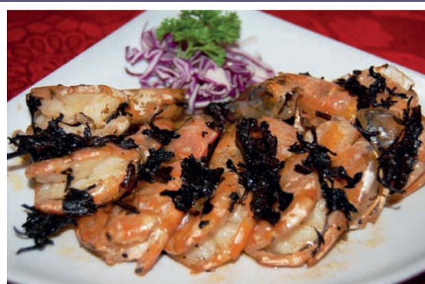
WOK-FRIED PRAWN WITH GREEN TEA MEMBER: RM28.00++ VISITOR: RM35.00++