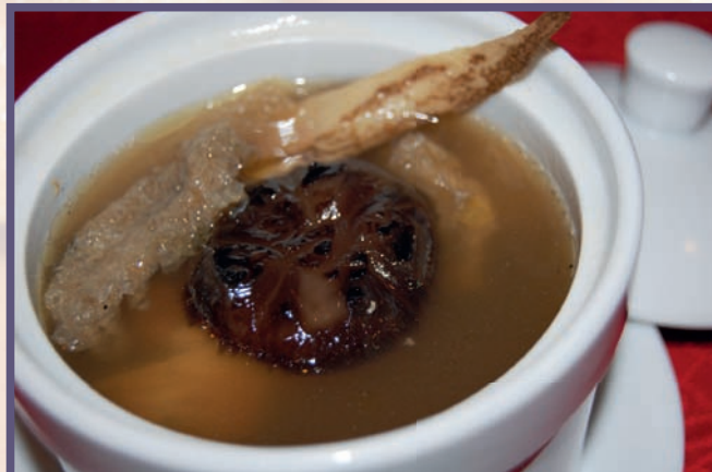
DOUBLE-BOILED ORGANIC CHICKEN SOUP MEMBER: RM10.25++ VISITOR: RM12.80++