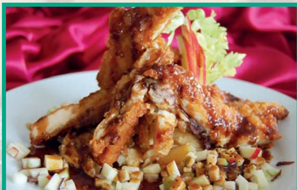
^ BREADED CHICKEN SERVED WITH MASHED POTATO, ^ FRUIT SALAD & BLACK PEPPER SAUCE ^ MEMBER: RM13.60++ VISITOR: RM17.00++