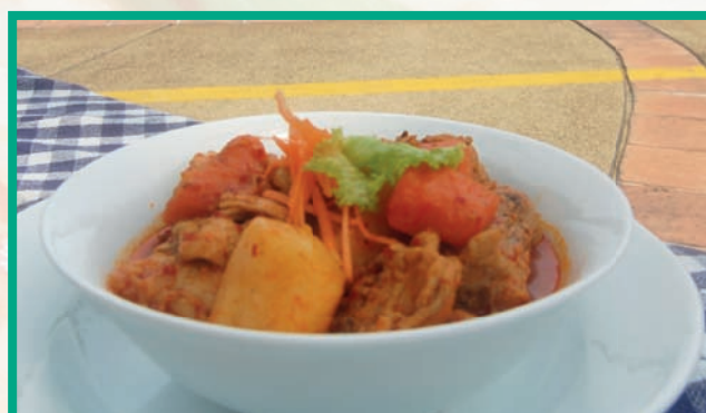
^ DAKDORITANG (SPICY CHICKEN) ^ MEMBER: RM16.80++ VISITOR: RM21.00++