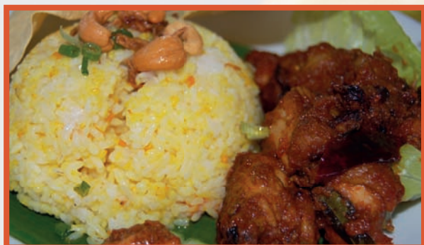
^ LAMB VARUVEL SERVED WITH BRIYANI RICE ^ MEMBER: RM9.60++ VISITOR: RM12.00 ++ ^