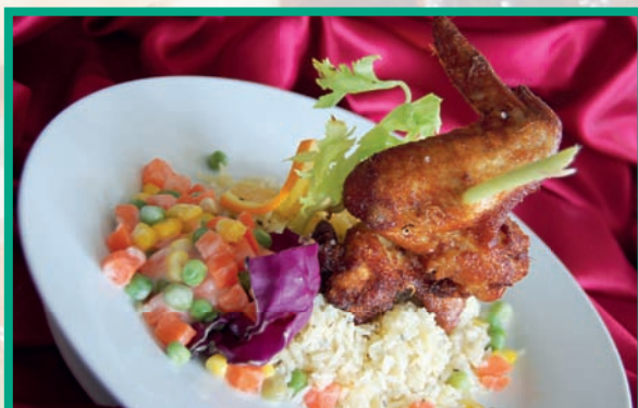
^ LEMON GRASS CHICKEN WINGS SERVED WITH ^ BUTTER RICE & MIXED GARDEN SALAD ^ MEMBER: RM12.00++ VISITOR: RM15.00++