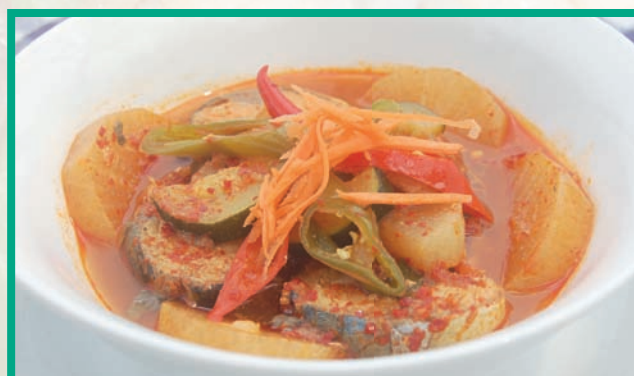
^ GODEUMGOJORIM (SPICY FISH) ^ MEMBER: RM18.40++ VISITOR: RM23.00++