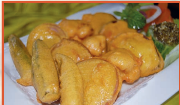
^ FISH ROLL WITH EGG PLANT ^ MEMBER: RM9.60++ VISITOR: RM12.00++ ^