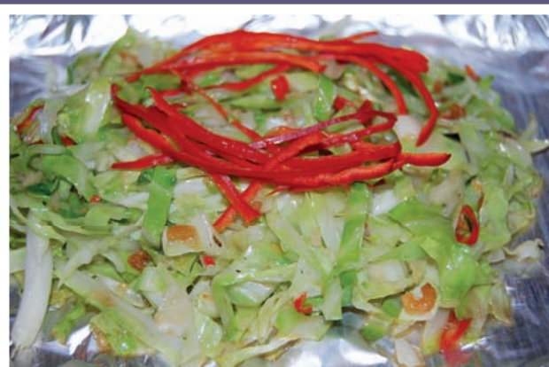
STIR-FRIED ROUND CABBAGE SERVED ON HOT PLATE MEMBER: RM12.00++ VISITOR: RM15.00++

IT'S ALL ABOUT WOK HEI AT THE GOLDEN DRAGON CITY AS OUR CHEF WHISKS UP SOME FIERY CREATIONS THIS APRIL, FEATURING FAVOURITES FROM MAINLAND CHINA. ENJOY THE GOODNESS OF ORGANIC CHICKEN IN MAY AND DROP BY IN JUNE TO SAVOUR SOME OF OUR CHEF'S SEAFOOD SPECIALITIES.