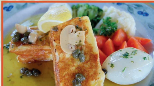
^ LEMON FISH FILLET WITH CRUSHED DRIED PLUM ^ MEMBER: RM14.40++ VISITOR: RM18.00++ ^