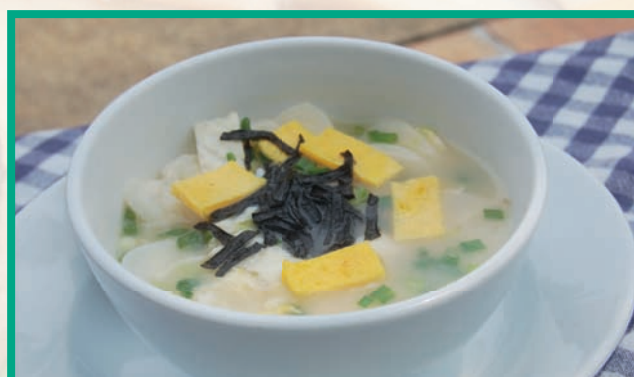
^ TOCK KUK (KOREAN RICE SOUP) ^ MEMBER: RM14.40++ VISITOR: RM18.00++