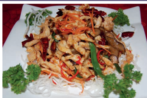
STIR-FRIED JULIENNED CHICKEN SZECHUAN-STYLE MEMBER: RM14.40++ VISITOR: RM18.00++