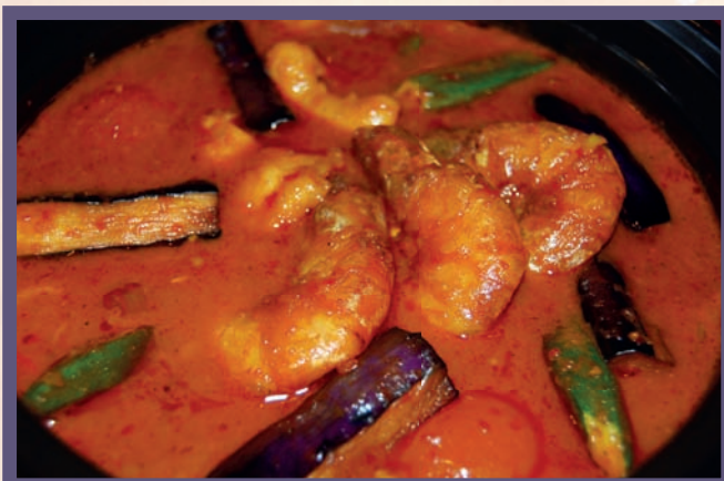
CHEF'S SEAFOOD SPECIAL IN CLAYPOT MEMBER: RM28.00++ VISITOR: RM35.00++