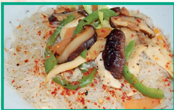
^ FRIED CRYSTAL NOODLE WITH BLACK MUSHROOM ^ MEMBER: RM8.80++ VISITOR: RM11.00++