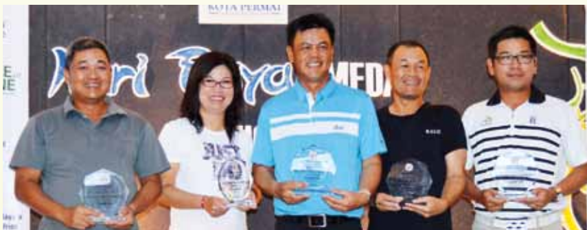
The winners are all smiles with their trophies

The August Hari Raya Monthly Medal saw participants taking to the course on Sunday morning of August 25 in good weather, and even better spirits.