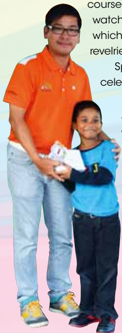
The little grand lucky draw prize winner with his new Titoni watch