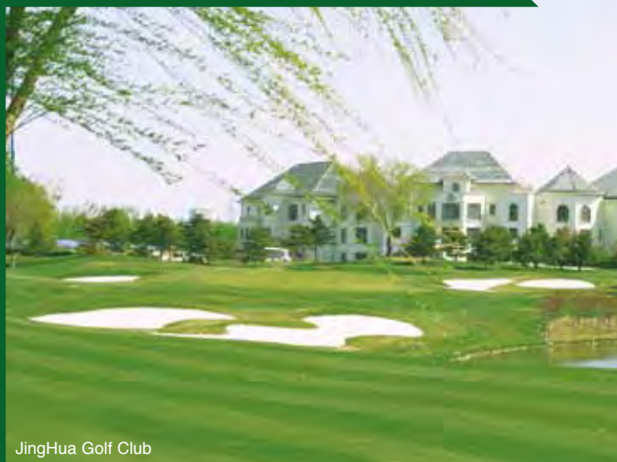
JingHua Golf Club