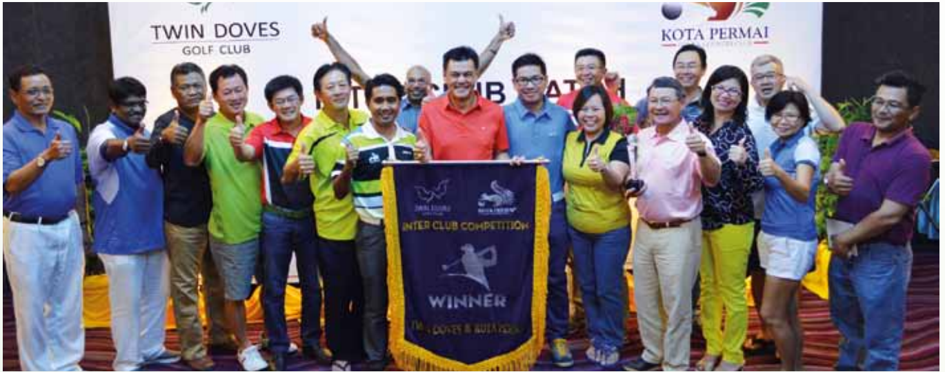
The 2013 champs

The Inter-club match with Twin Doves Golf Club on August 18 saw participants from both clubs pitting their skills in a two ball better ball format tournament that fine Sunday morning. While the defending champions battled hard to retain their clutch on the trophy, Twin Doves finally conceded to KPGCC who emerged the Overall winners on 390 points.