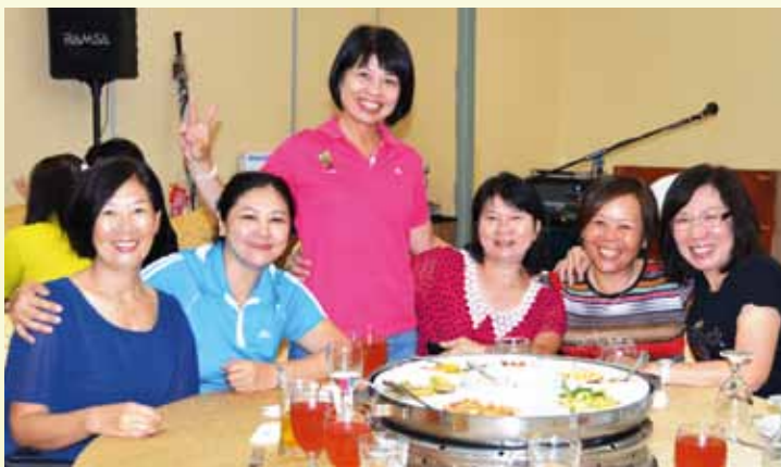
The ladies are all smiles