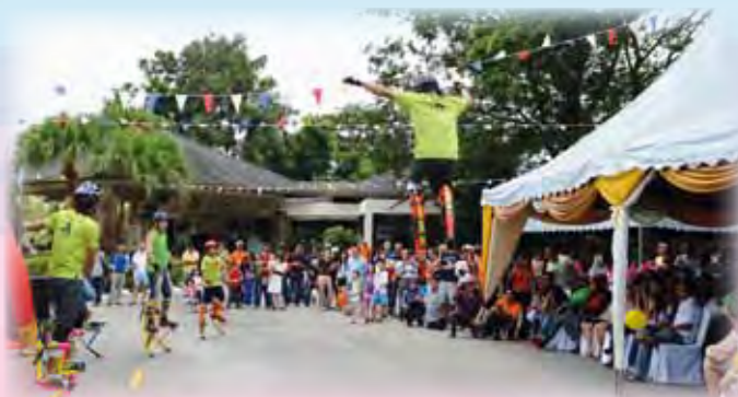
Skyrunners in action