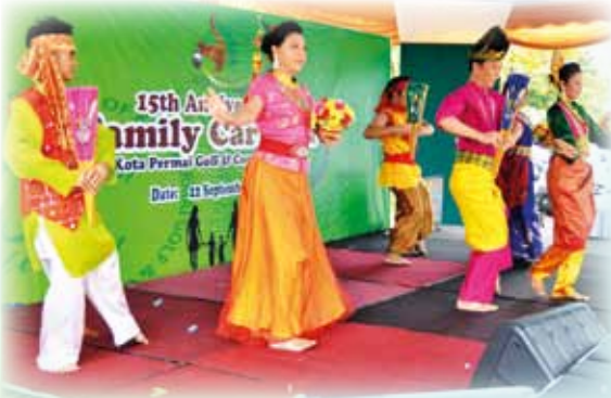
Entertainment included dancers