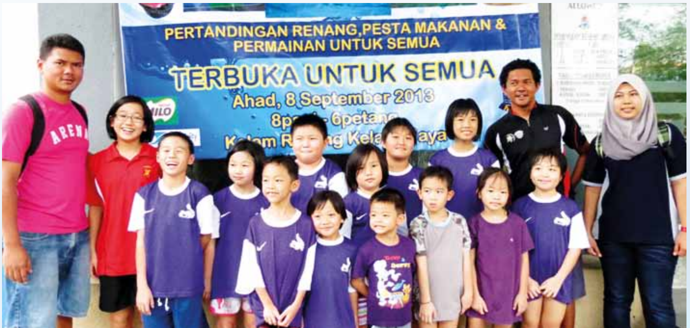
KPGCC's young swimming talents

The Petaling Jaya City Council's (MBPJ) annual MBPJ Swim Gala this year witnessed KPGCC's team of 13 swimmers in action at the Kelana Jaya Swimming Complex on September 8. Organised by the Stingray Club, the gala was made lively by a carnival atmosphere which was filled with the sights and sounds of over 200 participants aged between 5 and 46 plus their cheering families.