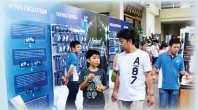
Strolling about the various exhibitions on display