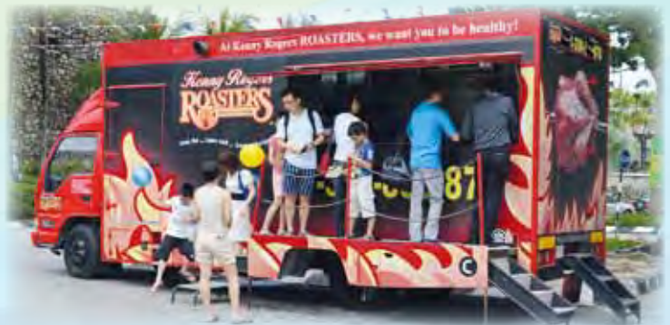
Food stall and foodtrucks for hungry carnival-goers!