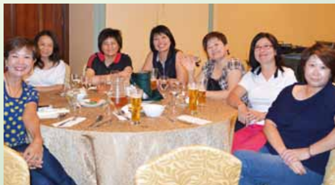
Cheers from us ladies!