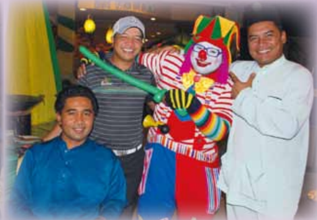
KPGCC's Management and staffs merry-making with Bozo the clown