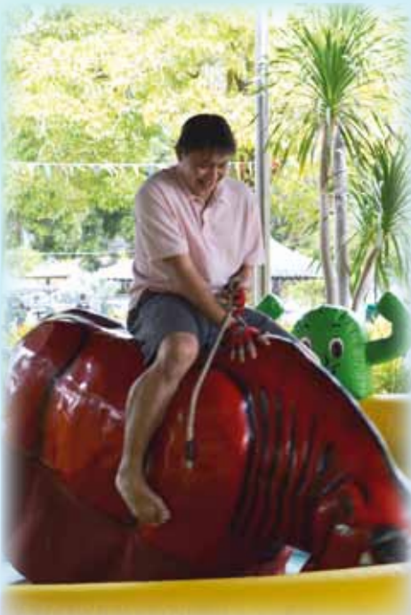
Rodeo bull challenge