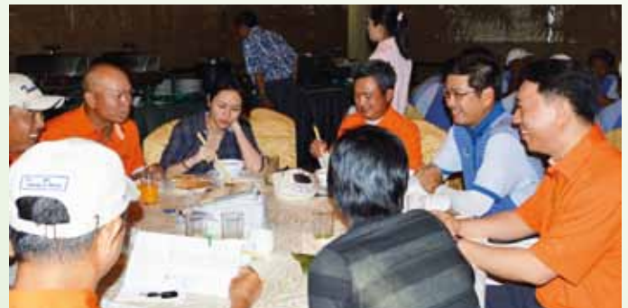
A hearty meal among friends