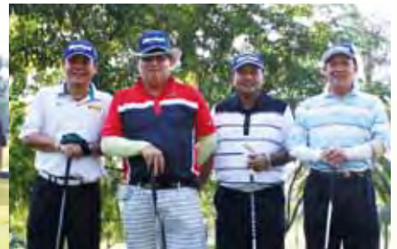
Some of the jolly participants

Jointly staged as the 2013 Cleveland Srixon Golf CSSB Open, the July Monthly Medal saw participants taking to the course in Stableford format on Sunday morning of July 7.