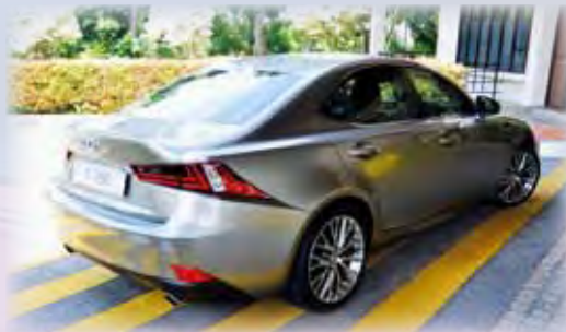
The new Lexus IS on display