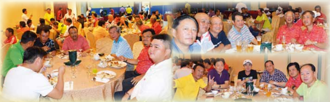
Some scenes during the luncheon