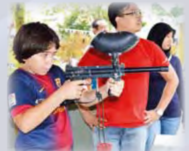
Lots of fun games!