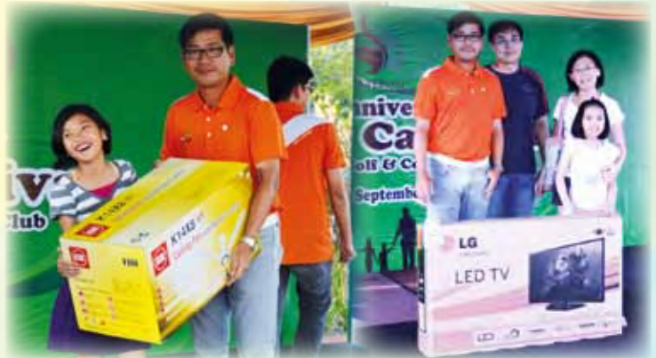
Happy lucky draw prize recipients

Spirits soaring, the day was truly a celebration of KPGCC's diversity!