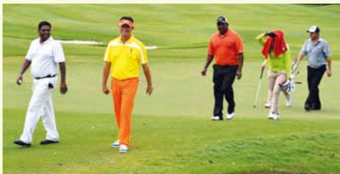
Cheery spirits on course

The August Hari Raya Monthly Medal saw participants taking to the course on Sunday morning of August 25 in good weather, and even better spirits.