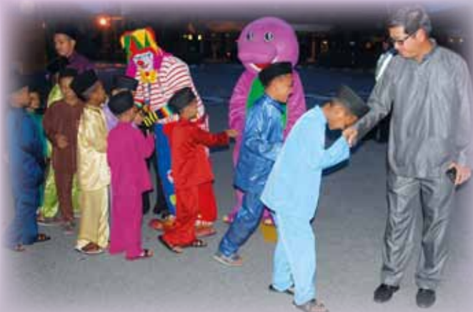
Hello and welcome!