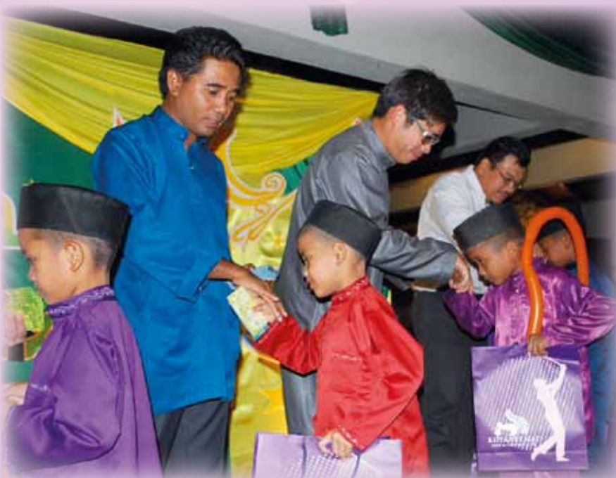
The children receiving goodie bags and packets of duit raya

Albert Pike American attorney, Confederate military officer and writer (December 29, 1809 – April 2, 1891)