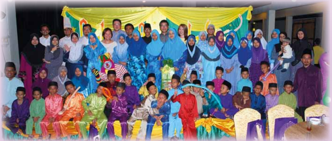
A cheery group photo

Delighting in the joy of giving during the holy month of Ramadhan, KPGCC hosted 50 residents from the Rumah Amal Kasih Bestari to a sumptuous buka puasa spread at the Club's Poolside Café on July 19.