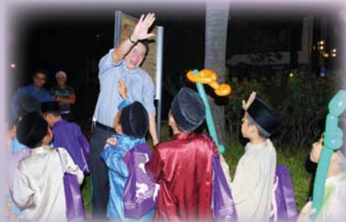
Goodbye and Selamat Hari Raya, kiddos!