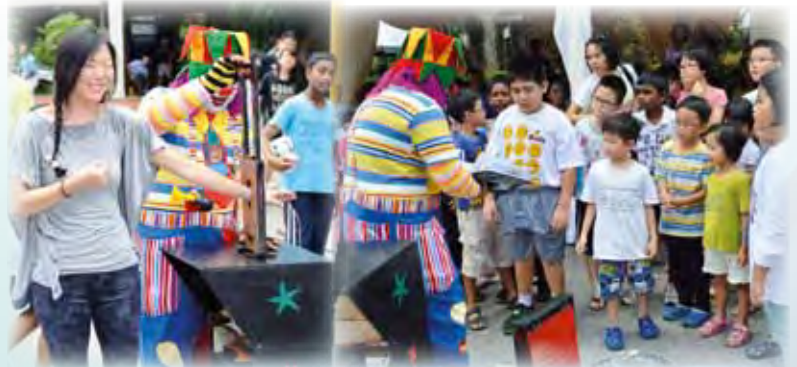
Loony carnival clowns on the loose!