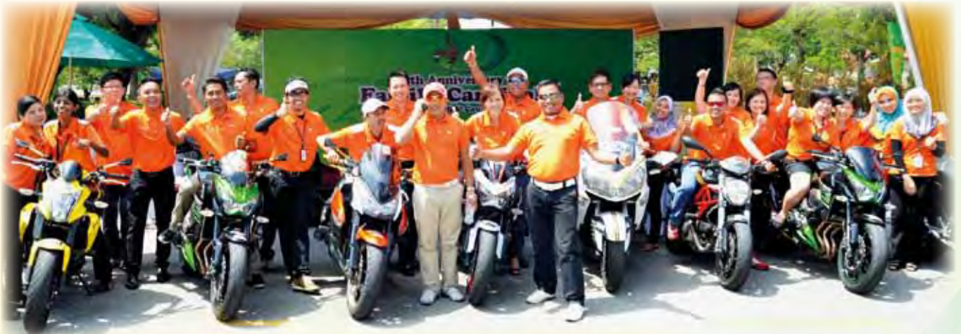
Welcome to our carnival!

What other way is there really to celebrate a birthday or anniversary than throwing a huge smashin' party?