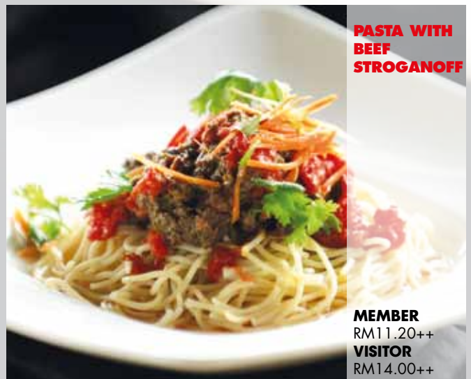
PASTA WITH BEEF STROGANOFF