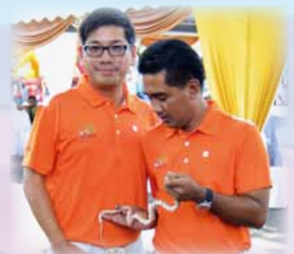
The snake charmers!