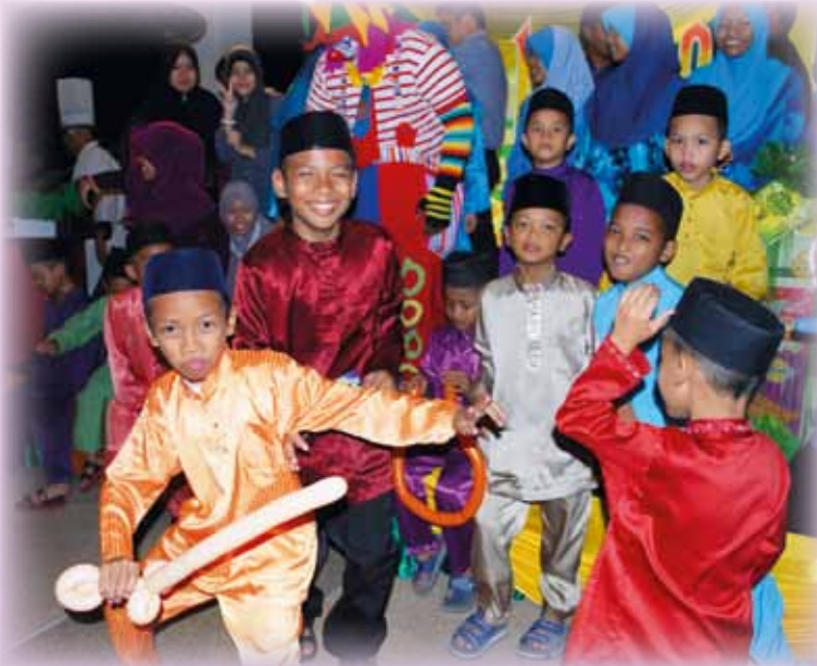
Fun for all ages!