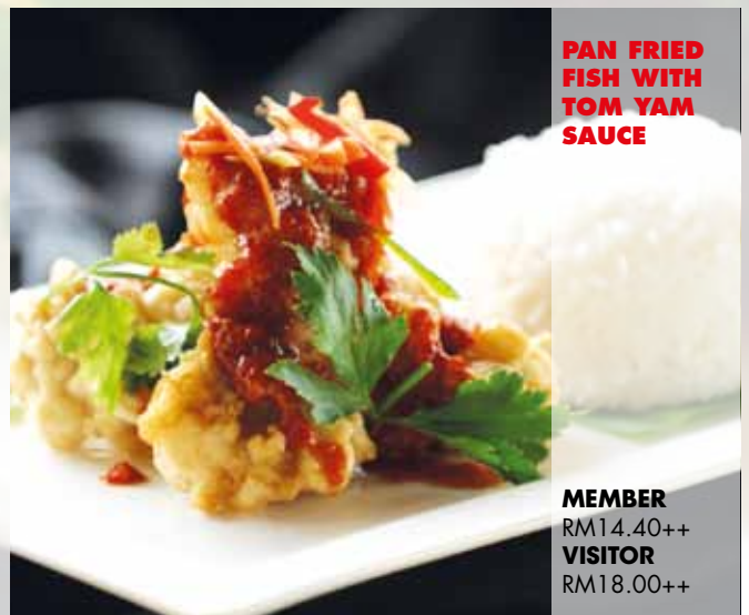
PAN FRIED FISH WITH TOM YAM SAUCE