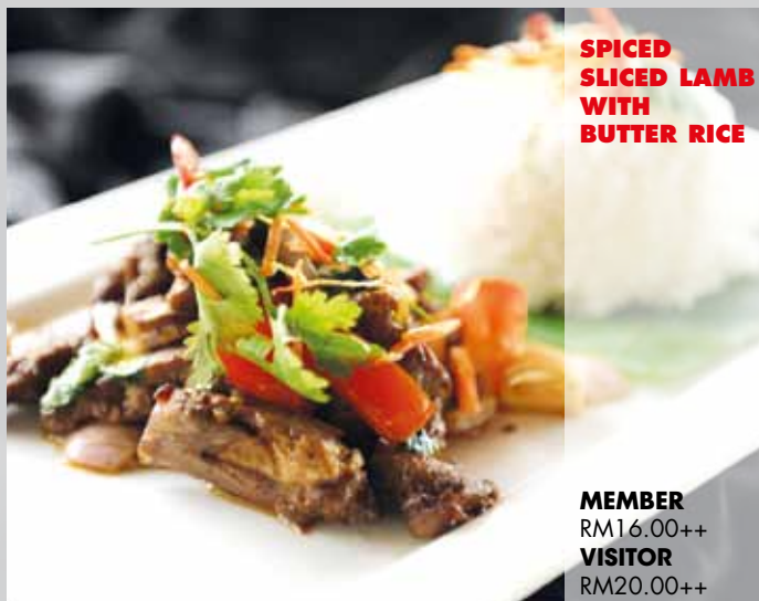
SPICED SLICED LAMB WITH BUTTER RICE