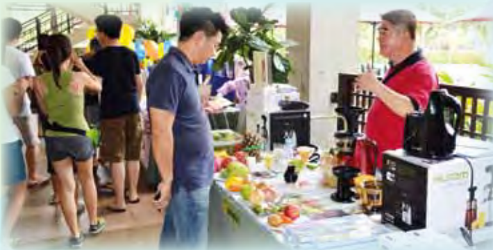
Members and guests visiting the various stalls and booths