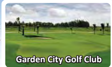
Garden City Golf Club