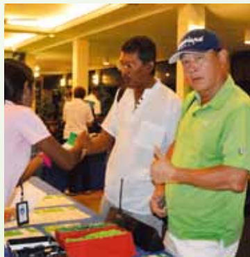
Participants during the registration