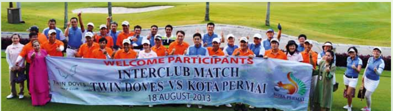
Participants pose before tee-off