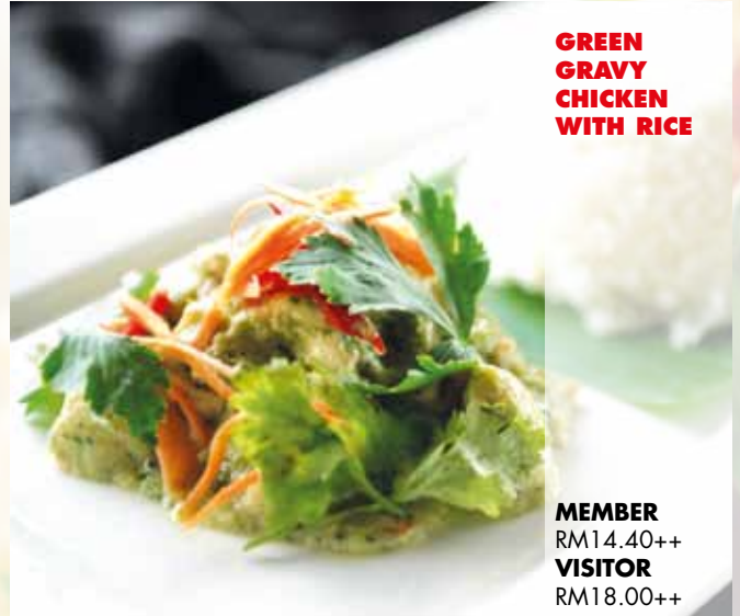
GREEN GRAVY CHICKEN WITH RICE