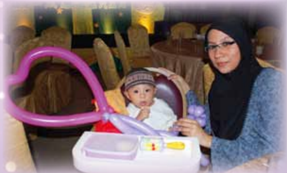
Yummy for my tummy!