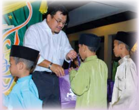
More goodies and duit raya!