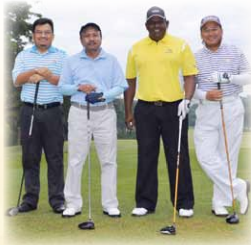
A couple of flights on-course