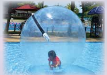
Cool hamster ball