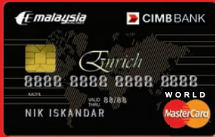
CIMB Enrich WORLD MasterCard by invitation only