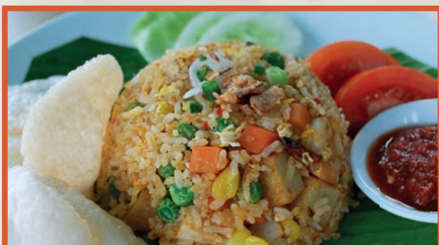
▲ NYONYA FRIED RICE ▲ MEMBER: RM7.20++ VISITOR: RM9.00++