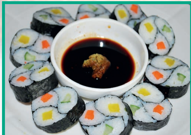
▲ THREE SEASONS ROLL ▲ MEMBER: RM9.60++ VISITOR: RM12.00++