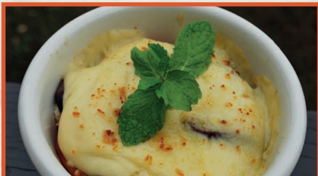
▲ MOUSSAKA (LAMB) ▲ MEMBER: RM7.20++ VISITOR: RM9.00++