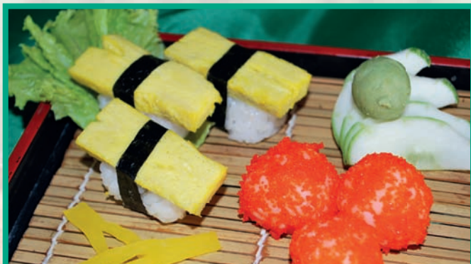
▲ POOLSIDE HANA SUSHI ▲ MEMBER: RM13.00++ VISITOR: RM10.40++