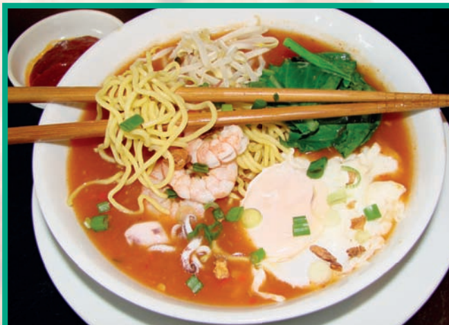
▲ MEE BANDUNG ▲ MEMBER: RM8.00++ VISITOR: RM10.00++