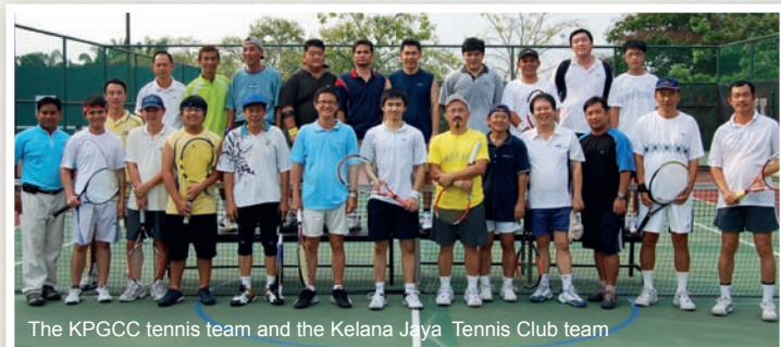
The KPGCC tennis team and the Kelana Jaya Tennis Club team

Tennis at KPGCC is indeed very active and the club organises up to six friendly club championship matches every