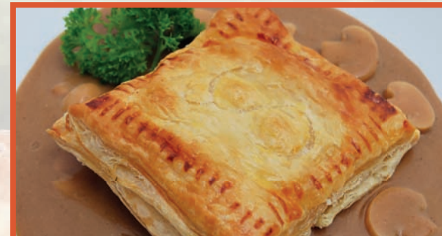
▲ SALMON PIE WITH MUSHROOM ▲ MEMBER: RM7.20++ VISITOR: RM9.00++