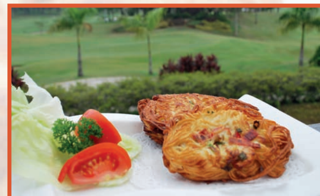
▲ MEE SUAH FRITTERS ▲ MEMBER: RM6.00++ VISITOR: RM7.50++