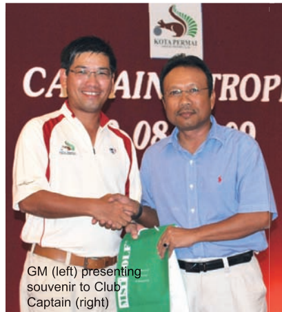
GM (left) presenting souvenir to Club Captain (right)