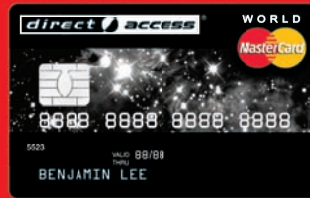
Direct Access WORLD MasterCard