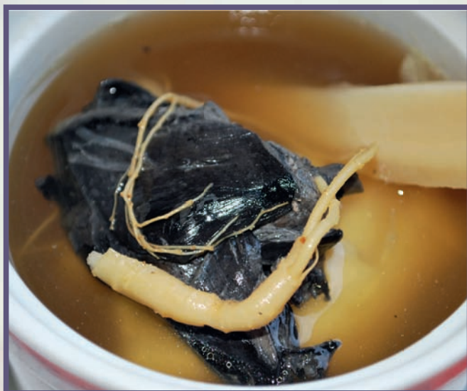
DOUBLE BOILED CHINESE HERBAL SOUP – RM9.80++

IF CHINESE FARE IS WHAT YOU YEARN FOR, THERE'S NONE BETTER PLACE THAN THE GOLDEN DRAGON RESTAURANT