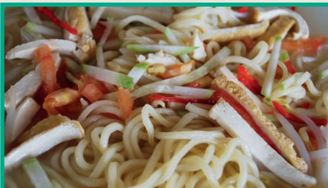
▲ MEE HAILAM ▲ MEMBER: RM8.00++ VISITOR: RM10.00++