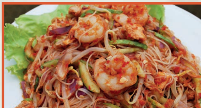
▲ KERABU MEEHOON ▲ MEMBER: RM7.20++ VISITOR: RM9.00++