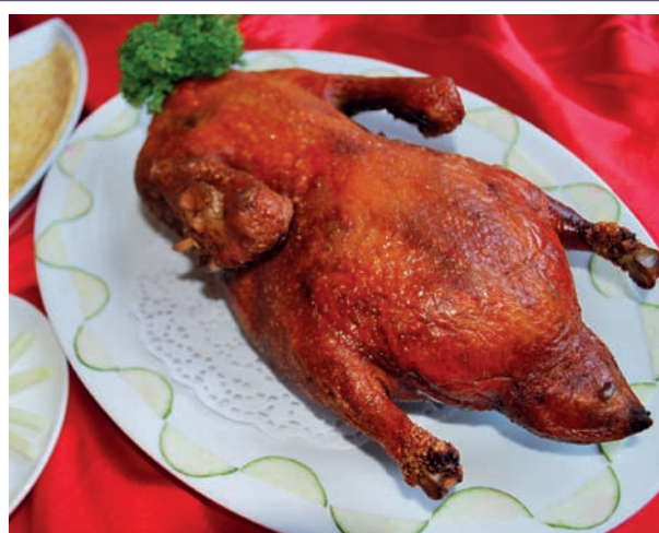
BEIJING DUCK PROMOTION (2 varieties) – RM38.00++ per bird