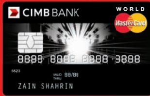
CIMB WORLD MasterCard