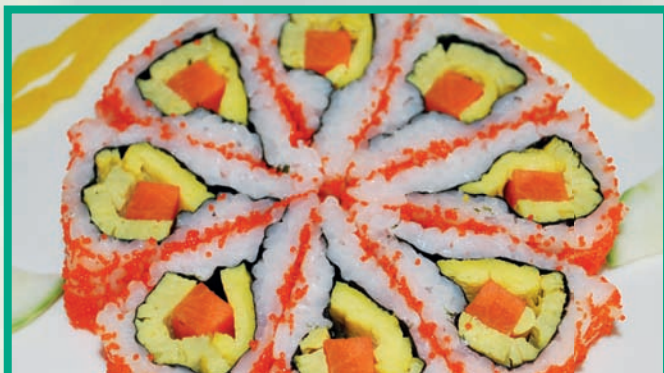
▲ CALIFORNIA MINI MAKI ▲ MEMBER: RM12.00++ VISITOR: RM15.00++