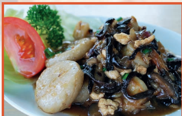
▲ HAKKA ABACUS ▲ MEMBER: RM6.00++ VISITOR: RM7.50++