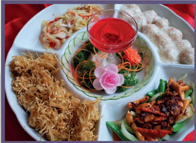
ANNUAL DINNER SET MENU – Starting From RM538.00++