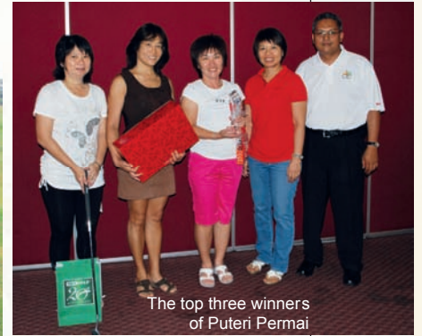
The top three winners of Puteri Permai