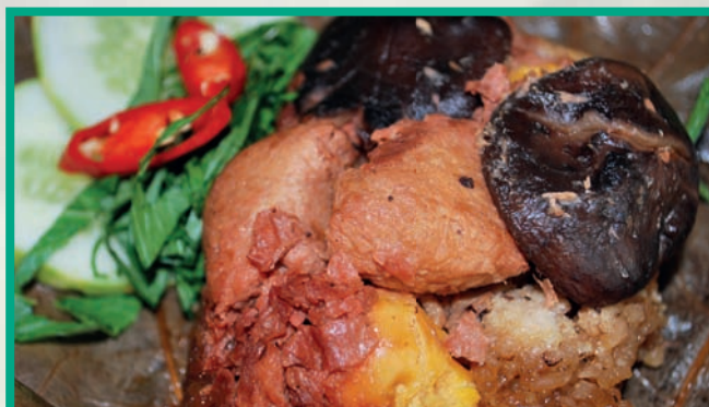
▲ KUIH CHANG HAINAN ▲ MEMBER: RM12.00++ VISITOR: RM9.60++