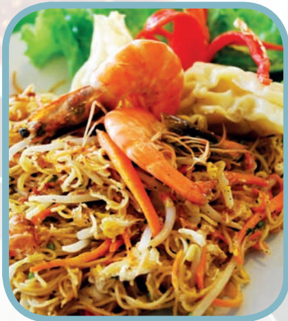
<<< FRIED WANTAN NOODLE WITH DUMPLING PRICE: RM9.00++