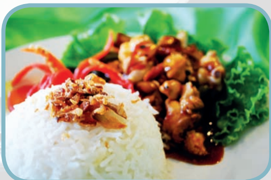
^^ AYAM MASAK PAPIK PRICE: RM9.00++