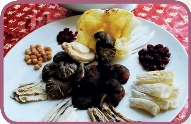
^ Buddha Jumps Over The Wall (per person serving) ^ MEMBER: RM40.00++ VISITOR: RM60.00++