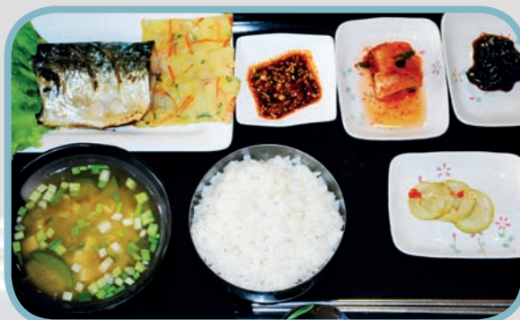
^^ GODEUNGOKUIE BENTO PRICE: RM21.00++

* KPGCC members enjoy 20% off the published price.