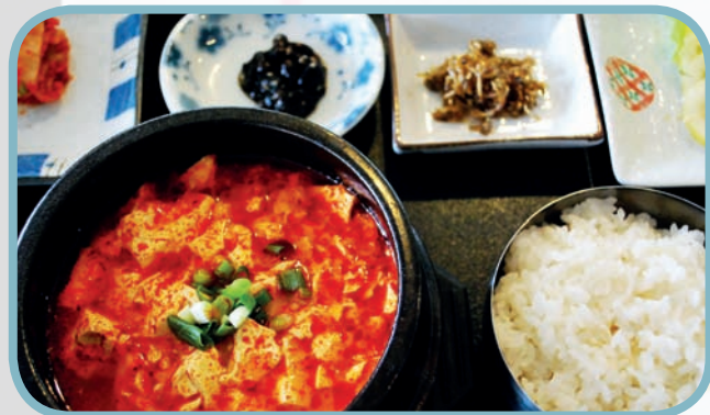
^^ SUNDUBU BENTO PRICE: RM21.00++