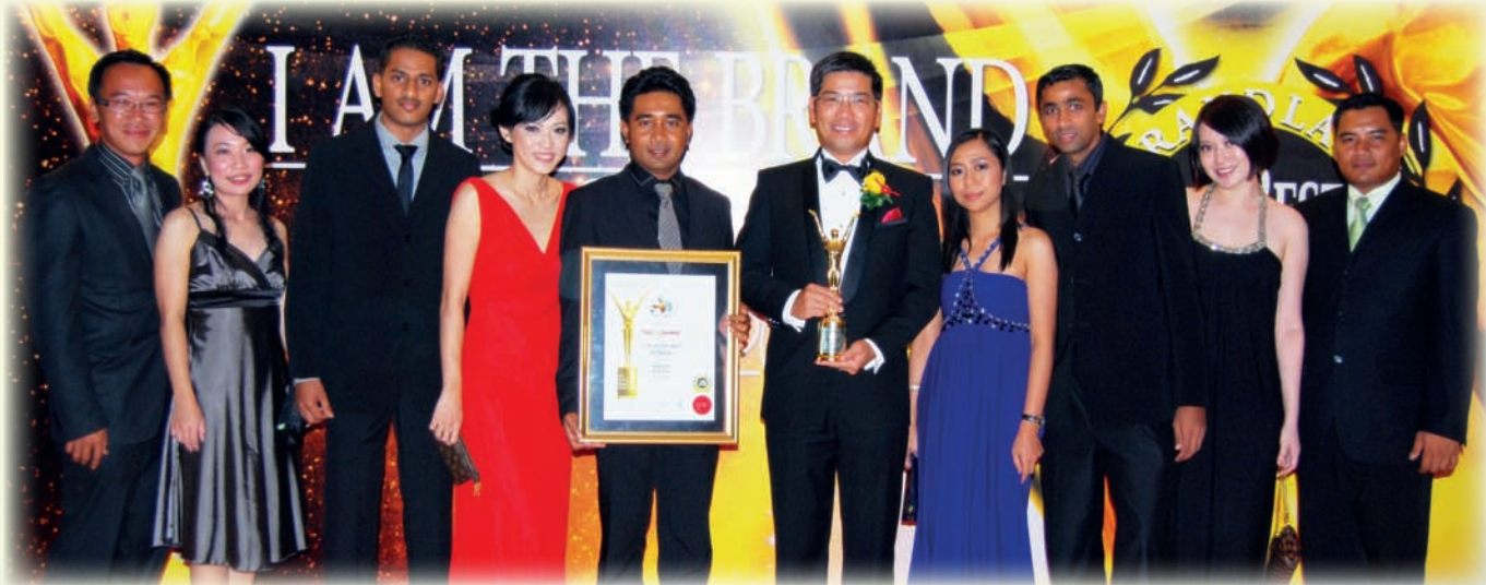
Proud achievement for KPGCC team

Defining moment for KPGCC as the Club is acclaimed as the Best Brand in Recreation – Golf Course