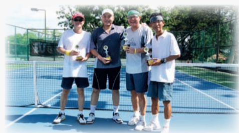
Men's division winners