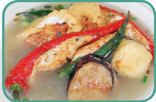
^ HAKKA YONG TAU FOO ^ PRICE: RM15.00++