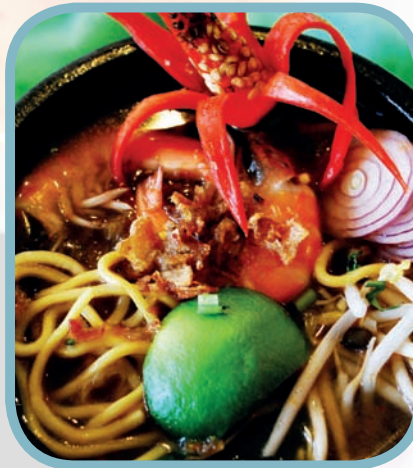
<<< MEE REBUS TERENGGANU PRICE: RM9.00++