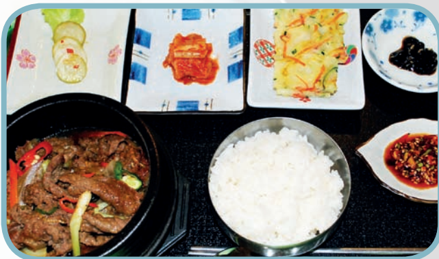
^^ BOOLGOGI BENTO PRICE: RM21.00++