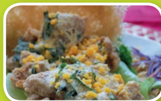
CHEF'S SPECIAL SALTED EGG YOLK FRIED CHICKEN