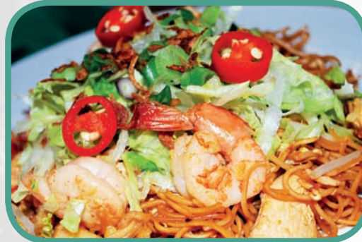
^ SINGAPORE FRIED MEE SUAH ^ PRICE: RM12.00++