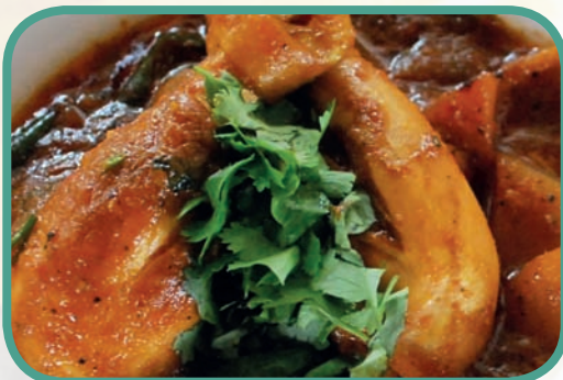
^ BRAZILIAN CHICKEN CURRY SERVED WITH ^ STEAMED FRAGRANT RICE ^ PRICE: RM18.00++