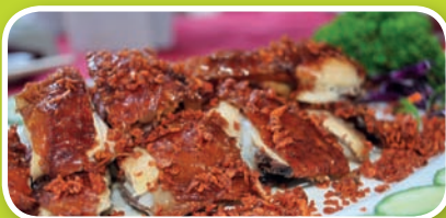
CRISPY ROASTED CHICKEN MONGOLIAN-STYLE

SPEND MORE THAN RM150 IN A SINGLE RECEIPT AND RECEIVE ONE OF THESE TWO CHICKEN DISHES ON US!