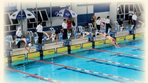
In they go!