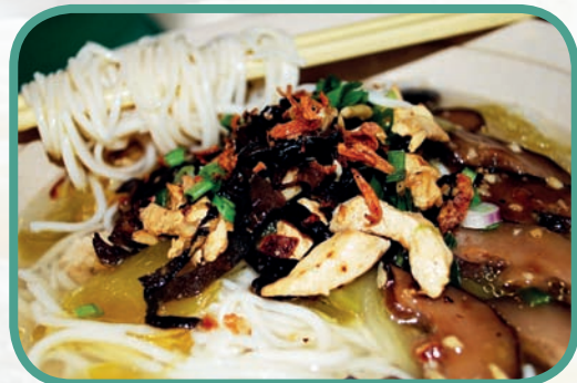
^ SHANGHAI NOODLE SOUP ^ PRICE: RM15.00++

* KPGCC members enjoy 20% off the published price.