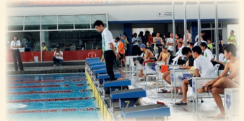
Before the start