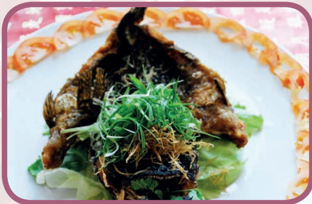
^ Soon Hock Fish Promotion ^ (Steamed, Deep Fried, Braised or Chef's Special ^ with ginger and spring onion) MEMBER: RM12.00++ /100gm VISITOR: RM18.00++/100gm