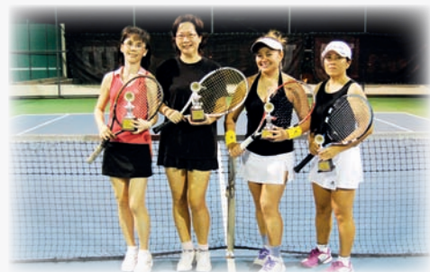
Ladies' division winners