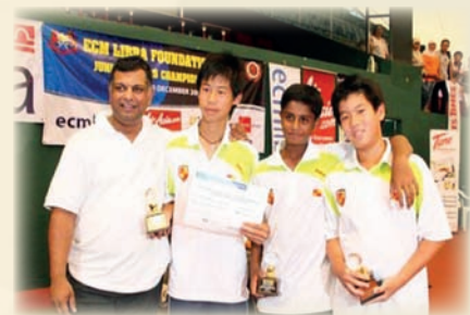
Receiving trophy from AirAsia CEO Datuk Sri Dr. Tony Fernandes