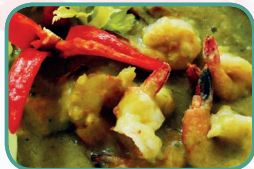
^ VATAPA (CREAMY PRAWNS) SERVED WITH ^ STEAMED FRAGRANT RICE ^ PRICE: RM22.00++