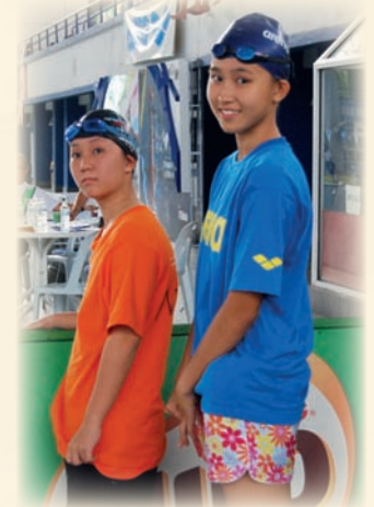
One for the album