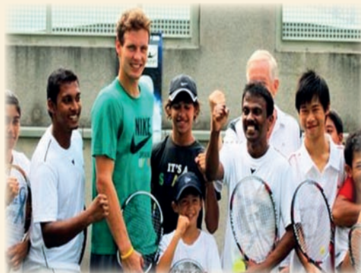
With Tomas Berdych