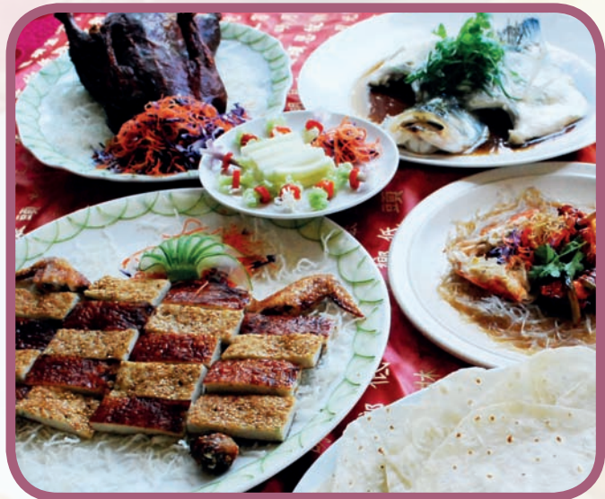
^ 1st Week – Beijing Duck ^ MEMBER: RM40.00 ++ ^ VISITOR: RM80.00++