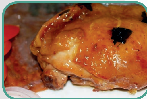
^ DEEP FRIED PAPER BAG CHICKEN ^ PRICE: RM15.00++