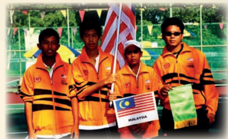
Part of the Malaysian junior tennis team