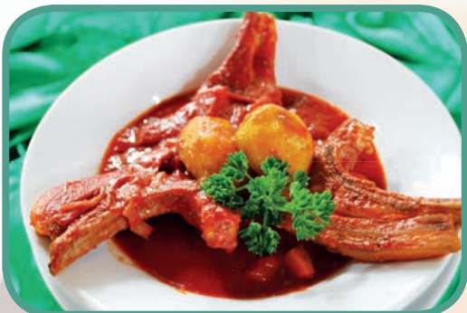
^ GRILLED LAMB RACK SERVED WITH RATATOUILLE, ^ VEGETABLES & POTATOES ^ MEMBER: RM20.80++ VISITOR: RM26.00++