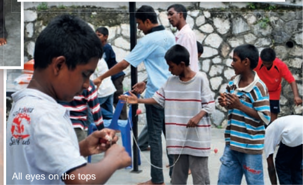
All eyes on the tops