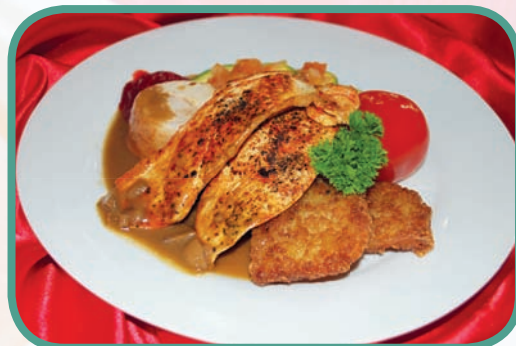
^ GRILLED CHESTNUT-STUFFED CHICKEN SERVED WITH ^ MIXED VEGETABLES, POTATOES & CRANBERRY SAUCE ^ MEMBER: RM16.00++ VISITOR: RM20.00++