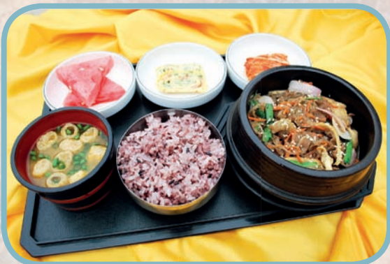
^ BULGOGI JUN SINK(SEASONED BEEF, GLASS ^ NOODLES & ASSORTED VEGETABLES SERVED ^ WITH RICE & SOUP) MEMBER: RM16.00++ VISITOR: RM20.00++