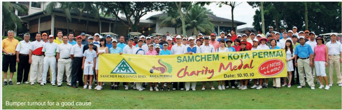
Bumper turnout for a good cause