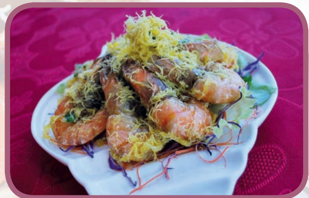
∧ Pan Fried Butter Grass Prawns* ∧ (S) RM30.00++ (M) RM45.00++ (L) RM60.00++