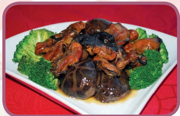
∧ Braised Dried Oysters with Fatt Choy & Mushrooms* ∧ (S) RM30.00++ (M) RM45.00++ (L) RM60.00++