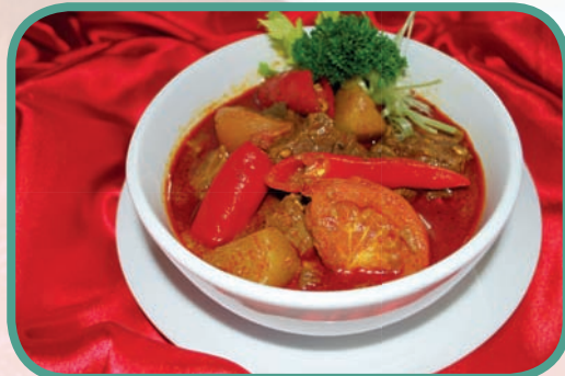
^ MUTTON CURRY SERVED WITH PAPADAM & ^ STEAMED FRAGRANT RICE ^ MEMBER: RM11.20++ VISITOR: RM14.00++