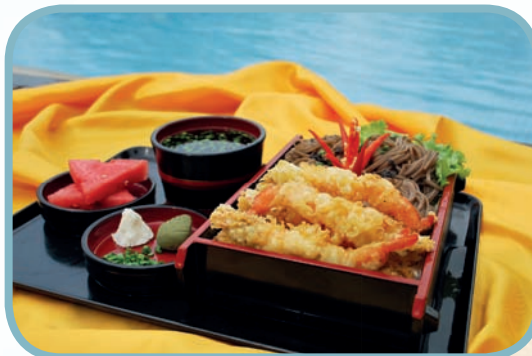
^ TENZARU SOBA (COLD BUCKWHEAT NOODLES ^ SERVED WITH EBI TEMPURA) ^ MEMBER: RM16.00++ VISITOR: RM20.00++