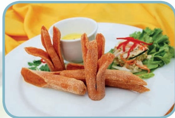
^ CHICKEN SAUSAGE FLORETS SERVED WITH MIX ^ VEGETABLES, ACCOMPANIED BY MUSTARD SAUCE ^ MEMBER: RM8.00++ VISITOR: RM10.00++