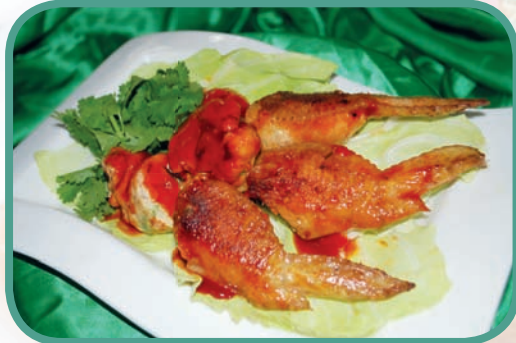
^ STUFFED CHICKEN WING WITH CORIANDER LEAF ^ MEMBER: RM12.00++ VISITOR: RM15.00++