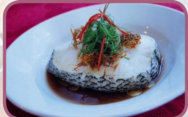
∧ Steamed Cod Fish – RM12 per 100gram ∧ (Normal price: RM16 per 100gram)