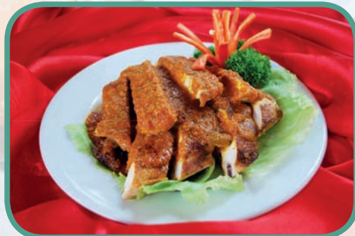
^ AYAM PERCIK SERVED WITH MIXED PICKLES & ^ STEAMED FRAGRANT RICE ^ MEMBER: RM9.60++ VISITOR: RM12.00++