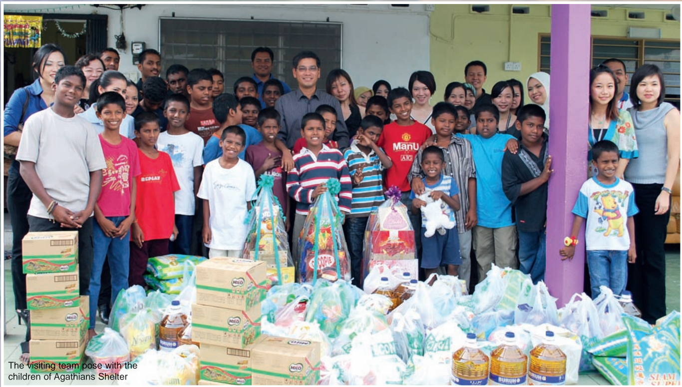
The visiting team pose with the children of Agathians Shelter

Kota Permai brings spark of hope to Agathians' children