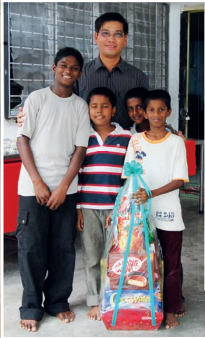
First place winners with Tang