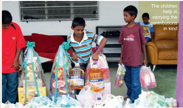
The children help in carrying the contributions in kind