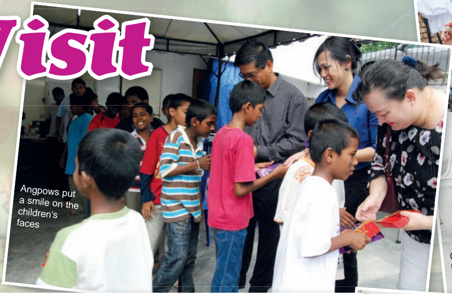
Angpows put a smile on the children's faces