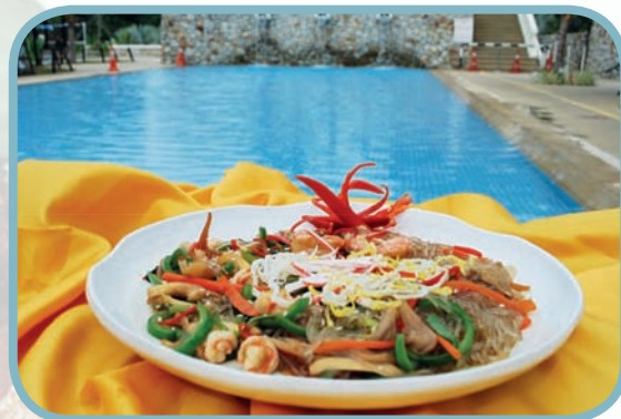
^ JAP CHAE (STIR-FRIED GLASS NOODLES, SEAFOOD ^ & ASSORTED VEGETABLES) ^ MEMBER: RM16.00++ VISITOR: RM20.00++