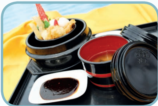
^ YONG TAU FOO ^ MEMBER: RM8.00++ VISITOR: RM10.00++