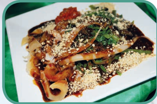
^ SOTONG KANGKUNG ^ MEMBER: RM9.60++ VISITOR: RM12.00++