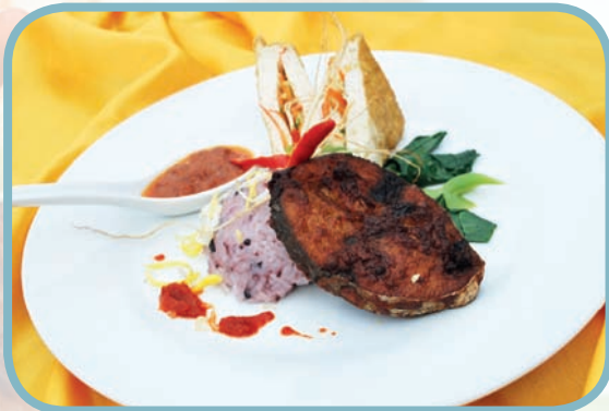
^ FRIED FISH SERVED WITH KOREAN-STYLE RICE, ^ VEGETABLES AND BEANCURD ^ MEMBER: RM9.60++ VISITOR: RM12.00++