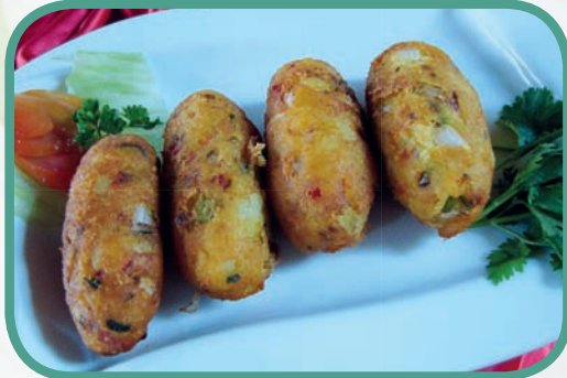
^ POTATO CUTLETS ^ MEMBER: RM5.60++ VISITOR: RM7.00++