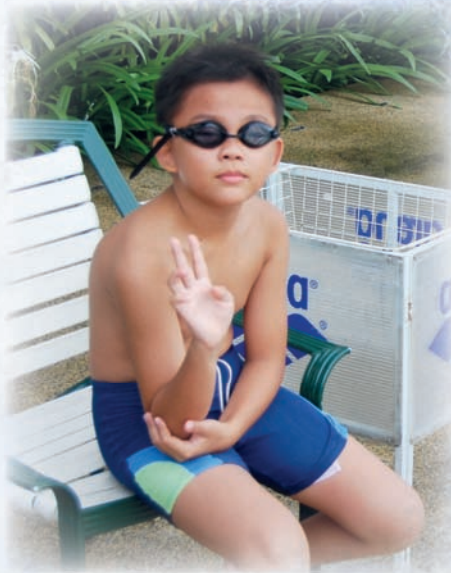
Cool as cucumber..

Personal bests and records fall at KPGCC's annual swim bash