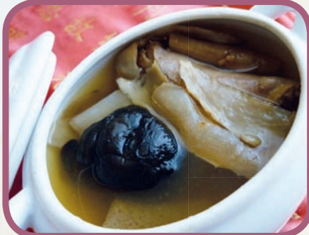
^ DINNER PROMOTION - DOUBLE ^ BOILED SOUP ^ VISITOR: RM6.00++