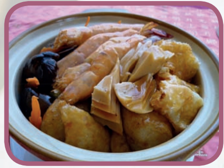
^ DELUXE SEAFOOD, ABALONE ^ & ROAST DUCK PLATTER ^ (PUN CHOY) MEMBER: RM29.80++ VISITOR: RM39.80++