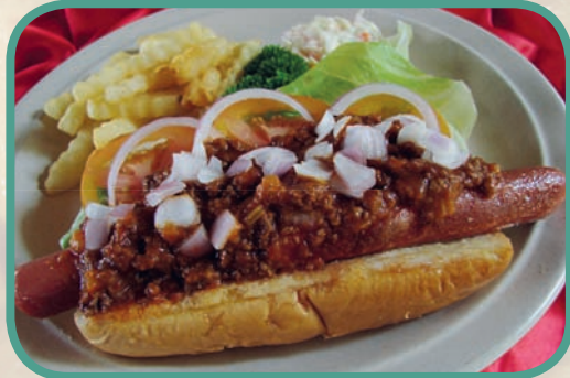
^ FOOT-LONG CHICKEN SAUSAGE SERVED ^ WITH CHICKEN BOLOGNAISE SAUCE, ACCOMPANIED ^ BY FRENCH FRIES ^ MEMBER: RM14.40++ VISITOR: RM18.00++