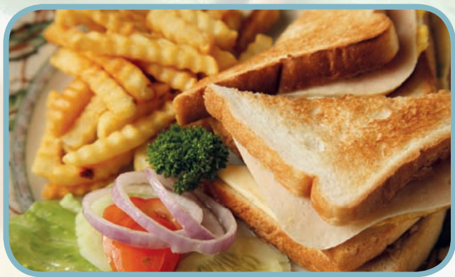
^ PERMAI SANDWICH ^ MEMBER: RM9.60++ VISITOR: RM12.00++