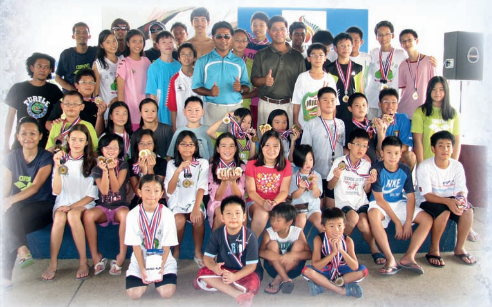
Champions parade their medals