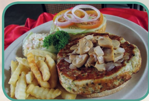
^ CHICKEN BURGER SUPREME ^ MEMBER: RM14.40++ VISITOR: RM18.00++