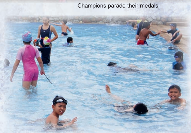
A splashing wet time!

KPGCC's 8 th Annual Swimming Championship on April 18 was a splashing success as junior swimmers not only displayed their abilities in the various categories contested but also went on to better their personal best times. A few new records were also registered as swimmers between the ages of six and sixteen took to the pool during the championship. Parents, family members and friends created a carnival-like atmosphere with their constant cheers of support, words of encouragement and clapping throughout the scheduled 52 events.