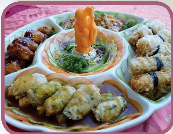
<<<< GOLDEN DRAGON CITY RESTAURANT CHINESE WEDDING PACKAGES FROM RM488.00++ TO RM1688.00++ PER TABLE