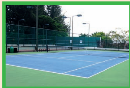
Courts 1 & 2 – After renovation

The Management hopes that tennis-playing members are having a great time playing on the newly resurfaced courts with its better bounce and traction. The Management will like to thank members for their patience and co-operation during the three-month renovation period.