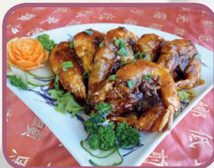
^ 136 SIGNATURE DISHES ^ MEMBER: RM12.00++ ^ VISITOR: RM15.00++