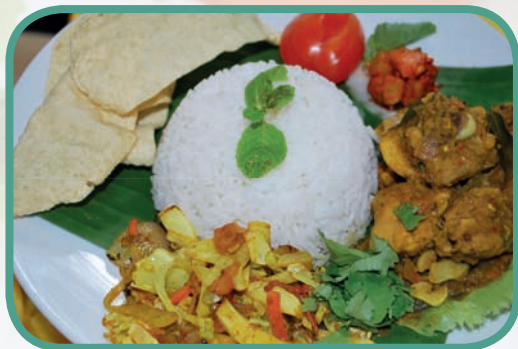
^ MASALA CHICKEN SERVED WITH MIXED VEGETABLES, ^ PAPADAM, PICKLES & STEAMED FRAGRANT RICE ^ MEMBER: RM8.00++ VISITOR: RM10.00++