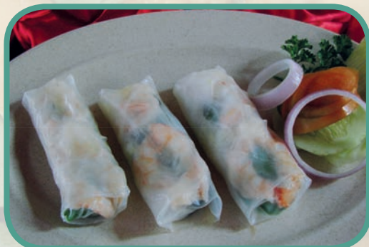
^ VIETNAMESE SPRING ROLLS ^ MEMBER: RM6.60++ VISITOR: RM12.00++