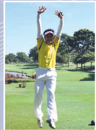
Men's best dressed Day 2 - TC Tan