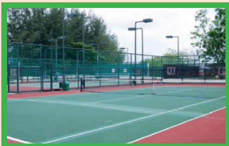
Courts 1 & 2 – Before renovation