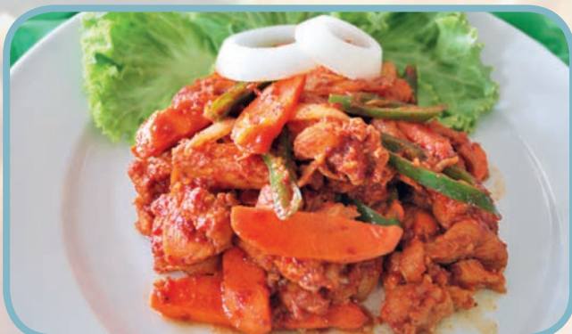
^ MAEUM CHICKEN (SPICY CHICKEN WITH RICE & SIX SIDE DISHES) ^ MEMBER: RM20.00++ VISITOR: RM25.00++