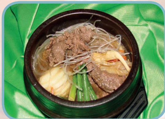
^ BEEF SPARE RIBS SOUP ^ MEMBER: RM18.40++ VISITOR: RM23.00++