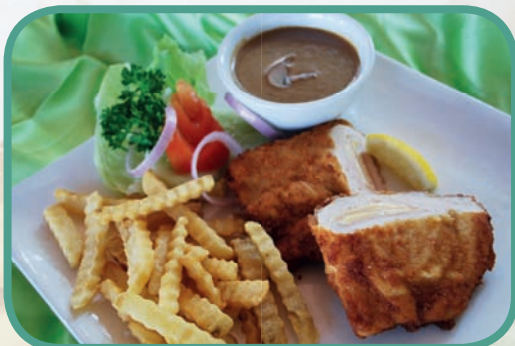
^ CHICKEN CORDON BLEU SERVED WITH CHEESE SAUCE ^ MEMBER: RM16.00++ VISITOR: RM20.00++