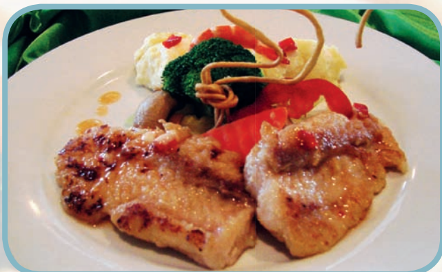
^ PAN FRIED FISH WITH THAI CREAM SAUCE ^ MEMBER: RM15.00++ VISITOR: RM19.50++