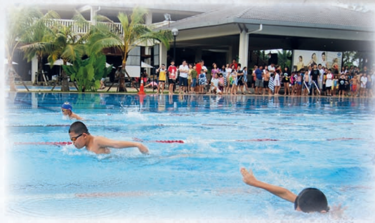
Off they go!