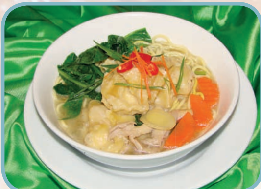
^ NOODLE SOUP WITH WANTON DUMPLINGS ^ MEMBER: RM8.40++ VISITOR: RM10.50++